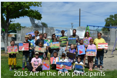
2015 Art in the Park participants

The Vale park was not its usual quiet at 9:00 am on June 14th when 15 kids and 18 adults took part in Drexel H. Foundation’s annual “Art in the Park, on Flag Day” on June 14th. Not only did the park playground equipment get a brand new coat of paint, the participants got the chance to win a trophy for 1st place in 5 age divisions in a mini-mural painting competition. This is the 15th year for this event. It all starts with picking up the litter in the park, then painting the metal playground equipment, followed by games, food, the mini mural competition and ends with awards & prizes.