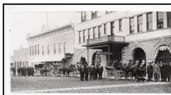
1908 Opening Day of Drexel Hotel