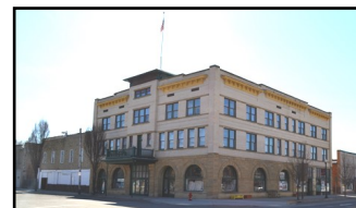
Drexel Hotel Today